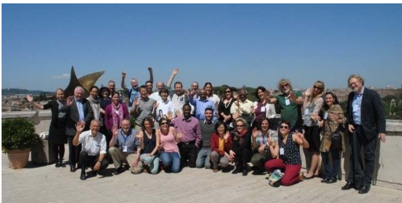
Scientists participating the workshop on microplastics in the marine environment (Rome, April 20~22)

Hong, Sunwook. (2015). Participation in experts' workshop on microplastics in marine environment. Marine Litter News from East Asia Civil Forum on Marine Litter , Vol. 6(1): 4-5.