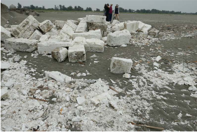
Fig 3. EPS pollution (3)