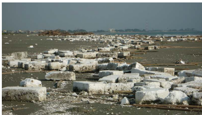
Fig 1. EPS pollution (1)