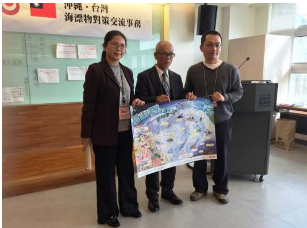
Joint event of Okinawa County of Japan and New Taipei City of Taiwan

Taiwan Environmental Information Center. (2015). Okinawa organizations visited Taiwan and helped out with beach clean-up. Marine Litter News from East Asia Civil Forum on Marine Litter , Vol. 6(1): 14-15.