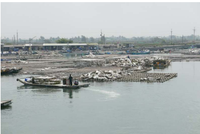
Fig 5. EPS foams recycling