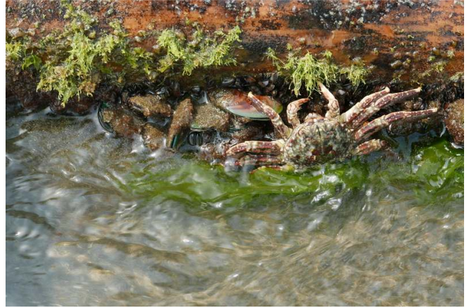
Fig 6. Oysters racks provide shelters for marine organisms (1)