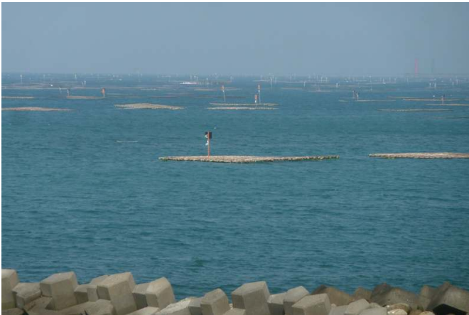
Fig 4. EPS foams are used as floating gears offshore