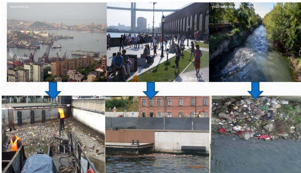
Fig 1. Vladivostok coastal area

It is evident that the marine litter issue is a reality for all maritime countries. During the events organized by Regional Activity Center, Northwest Pacific Action Plan (NOWPAP RCU) we discussed this issue, shared our experience, decisions were made on various administrative and social levels, and now we can see some results of these activities.