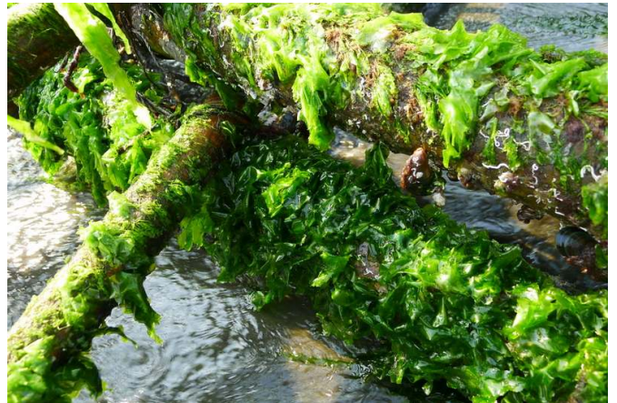
Fig 7. Oysters racks provide shelters for marine organisms (2)