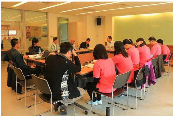
Workshop held in Okinawa County

and Kuroshio Ocean Education Foundation. The representatives shared and discussed their experiences during the three-day long workshop.