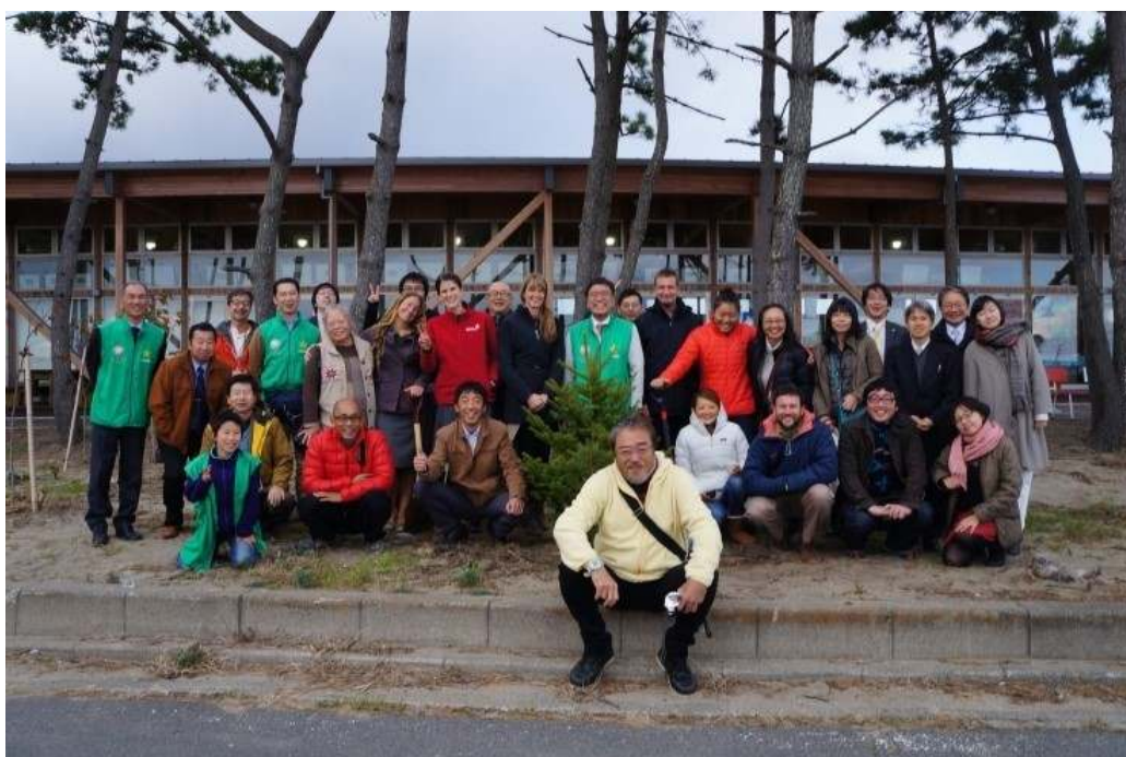
Attendants and staffs of the symposium at Yuriage Maple Pavilion, Yuriage City, Sendai Prefecture, Japan