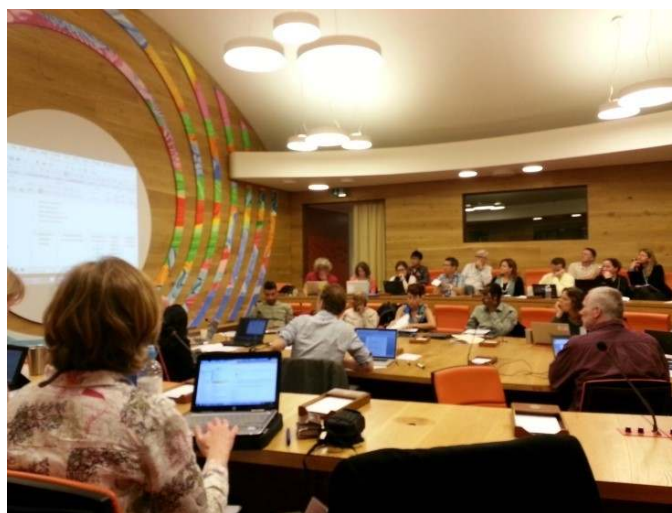
Scientists participating the workshop on microplastics in the marine environment (Rome, April 20)