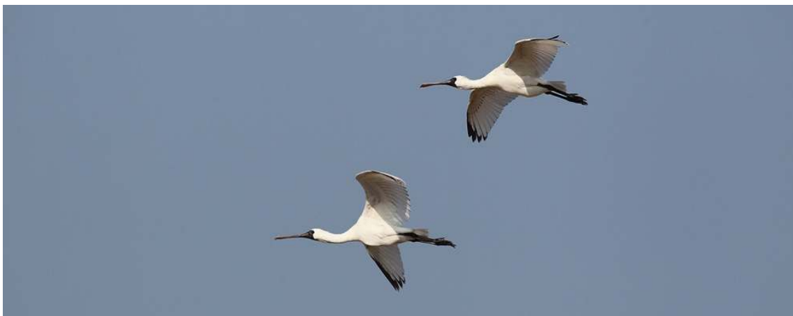
Fig. 1. The Black-faced Spoonbills

The result invites us to make more effort to protect these beautiful birds. As most of the Black-faced Spoonbills breed in the western coast of Korea, making a clean environment in this area is the key issue for this endangered species of birds. Our Sea of East Asia Network will continue these activities of protecting wildlife from marine debris.