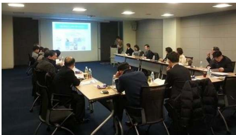
First meeting for research for countermeasure framework against marine plastic litter in Korea

Kim, Sujin. (2015). Research for countermeasure framework against marine plastic litter in Korea. Marine Litter News from East Asia Civil Forum on Marine Litter , Vol. 6(1): 6-7.