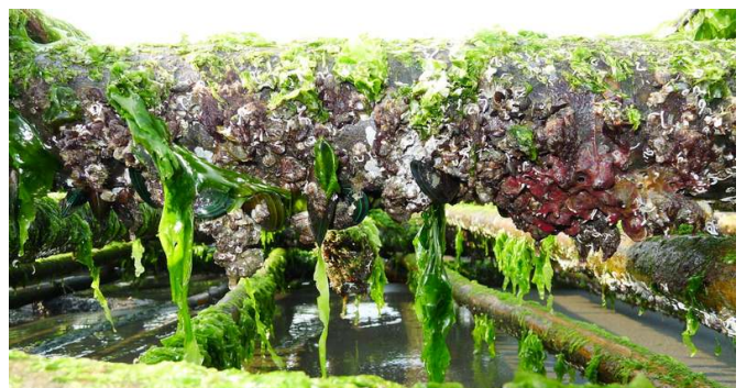
Fig 8. Oysters racks provide shelters for marine organisms (3)