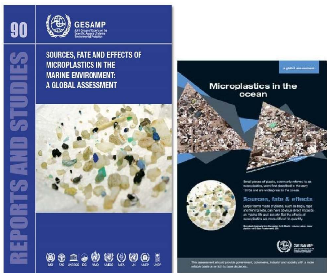
The 1st report on microplastics by GESAMP experts recently released