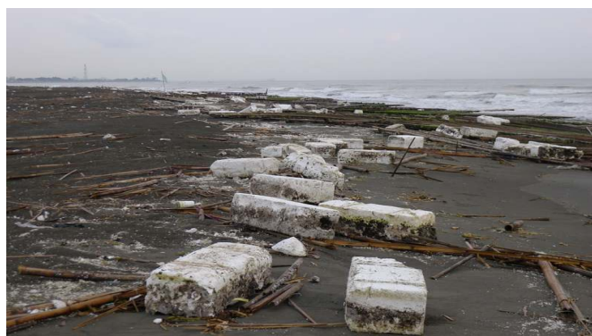
Fig 2. EPS pollution (2)