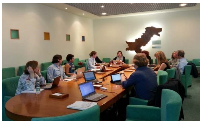
Group discussion to agree terms of references on each specific topic of microplastics

Marine microplastic debris has been acknowledged as an important environmental issue. Based on compiling of up-to-date information and knowledge, the scientists will provide implications on how we should respond to this issue.