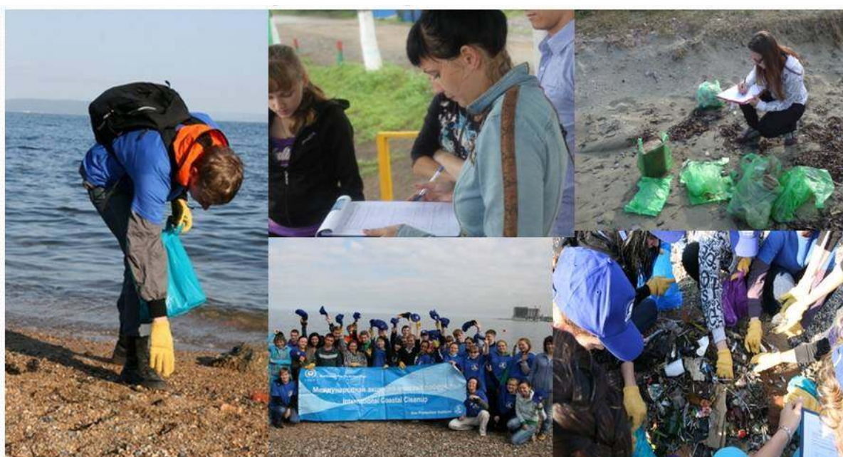
Fig 2. Institute of sea protection and shelf development practical research

During the past 7 years, the students and staff of the Institute of Sea Protection and Shelf Development, Maritime State University named after adm. G.I. Nevelskoy take their part in coastal area cleaning (Fig 2). The geography of these actions expands significantly (Fig. 3). They cover most popular recreation sites in Vladivostok, Hasansky, Nadezhdinsky, Shkotovsky, Partizansky, Olginskly, Terneisky and other districts. Students, social organizations, and authorities are always involved in these activities.