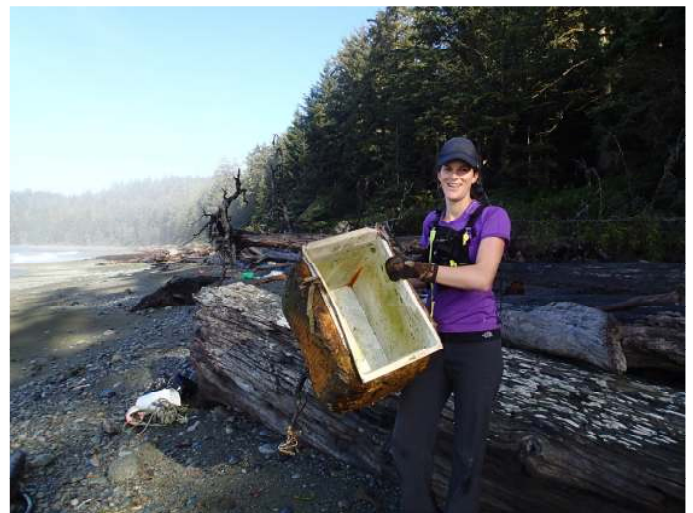
Container from Japan washed up on a beach, Canada