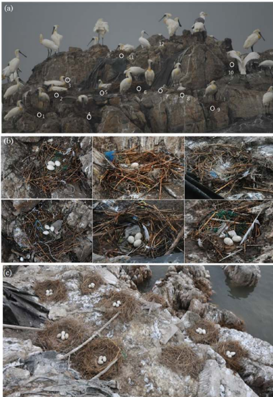
Fig. 2. Black-faced Spoonbills in their breeding islet (a). The plastic marine debris in their habitat in 2010 (b) was reduced in 2011 by the human efforts of providing natural materials (c) (Lee et al., 2015).