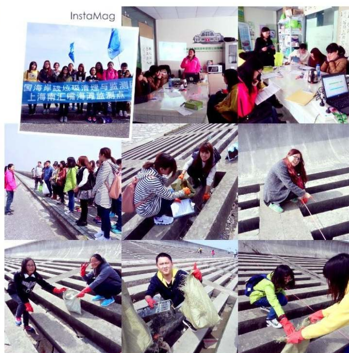
Coastal clean-up and monitoring project in China