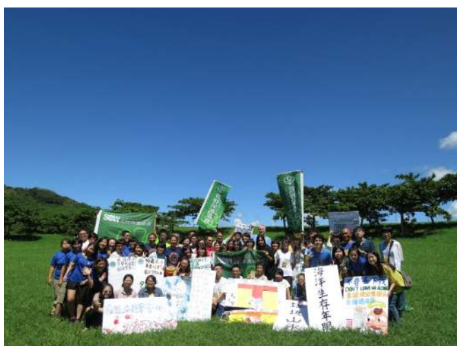
The Clean Ocean Youth Movement 2014, Taiwan

Wu, Chun Chi. (2014). Clean Ocean Youth Movement in the Plastic Era: The ocean needs your action! Marine Litter News from East Asia Civil Forum on Marine Litter, Vol. 5(2): 6-7.