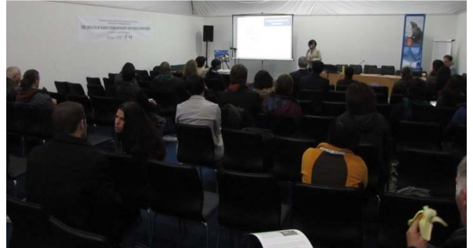
Side event was held in a big temporary tent. About 40 people were present.

We, OSEAN, would like to ask you to pay attention to the issue.