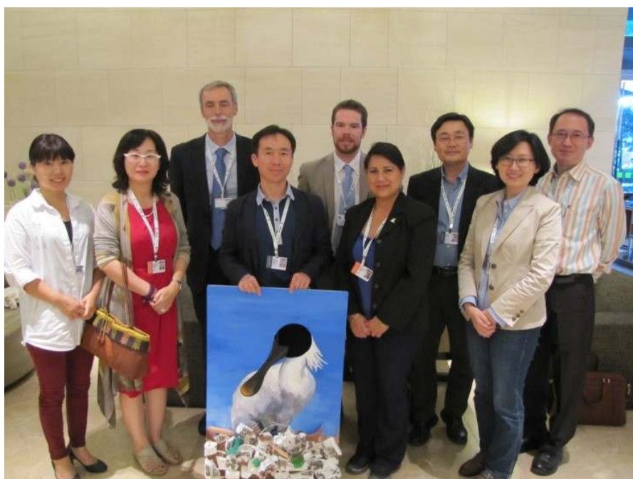
Pre-workshop discussion was had by co-hosts