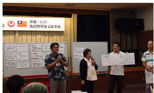
Seminar to exchange the knowledge and experiences on marine litter management