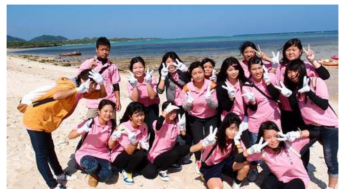
Joint cleanup of Taiwan-Okinawa at the beach of Ishigaki Island, Okinawa Prefecture (Southwesternmost location of Japan)