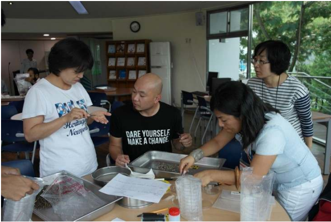
Classifying, counting, and weighing micro-plastic samples

I hope such cooperation can continue throughout the Asia-Pacific region.