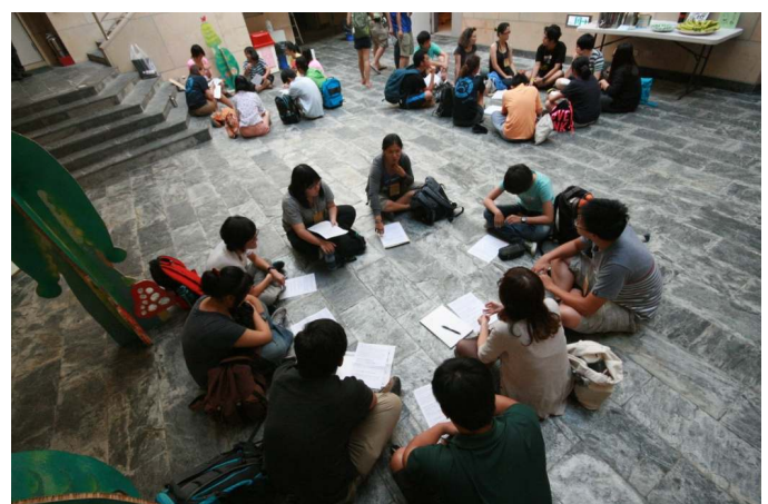
The Clean Ocean Youth Movement 2014, Taiwan