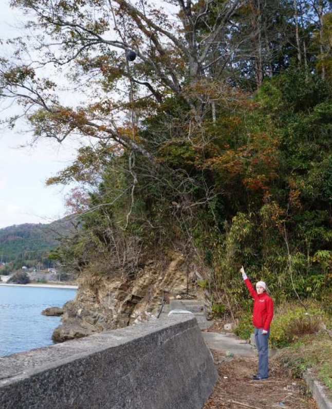
The fishing buoy in the tree shows the height of the wave from the 2011 tsunami

Perhaps you've heard about the Japanese motorbike and boats that washed ashore in North America? North Pacific gyres carried debris from Japan across the ocean to the shores of British Columbia and the United States. Despite the media attention to these events, items related to the tsunami are a fraction of the marine debris that enters the ocean every day. Litter from land based activities, fishing and shipping dominates the material we find on Pacific beaches.