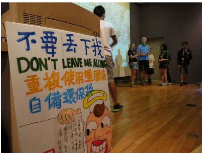
The Clean Ocean Youth Movement 2014, Taiwan

After the course, the students were divided into several groups and made their concrete implementation plan which aimed to raise the public awareness to reduce the plastics. They went to the Kenting Street to persuade shopkeepers not to automatically offer plastic bags to their customers. With a hand-made poster, the students informed the shopkeeper of the harmful effects of plastic bags on the environment and humans. It was apparently easier to work with smaller local shops than chain stores as the later usually have Standard Operation Protocol for staff to follow. In just a few hours, the students successfully put up their slogans in over 20 shops, which stated, "We do not automatically provide plastic bag!" Later that day, the shopkeeper said the slogans make it easier to convey the message and they were actually very proud of it. Plastic bags also represented a cost to them; therefore it was also economically appealing to them to give out less of them to the customers. The students realized that it is all about breaking the "old" habit; the convenient life with plastics. Start now and it is not as difficult as they think.