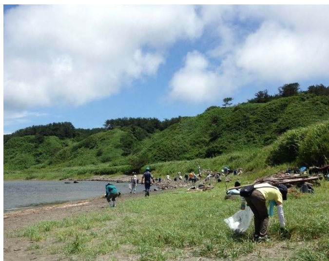
Cleanup on a beach of Tobishima island, NW Japan

In sum, marine debris, both as a national and transboundary problem requires cooperation of diverse sectors of the society as well as regional and international collaboration for effective management. In fact, it is difficult to identify which sector of the society is not involved. At both national and transboundary levels, the public's increased awareness and constant attention on marine debris as "Yes-in-my-backyard" problem is required for a long-term successful management. Moreover, strengthening current management practices through its institutionalization and systematization will be expected for the future management of marine debris.