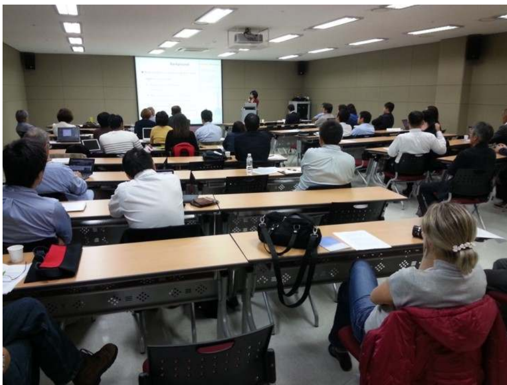
Litter Session at North Pacific Marine Science Organization (PICES), 2014

The North Pacific Marine Science Organization, also known as PICES, was established in 1992. As of 2014, there are five members: the U.S.A, Canada, Japan, Russia and Korea. Marine debris was dealt with as an important issue at the event. PICES has an annual workshop for sharing scientific research results, and this year it was held in Yeosu, Korea. Additional information about the organization and this year's workshop can be obtained from the following website, https://www.pices.int/meetings/annual/PICES-2014/2014-background.aspx .