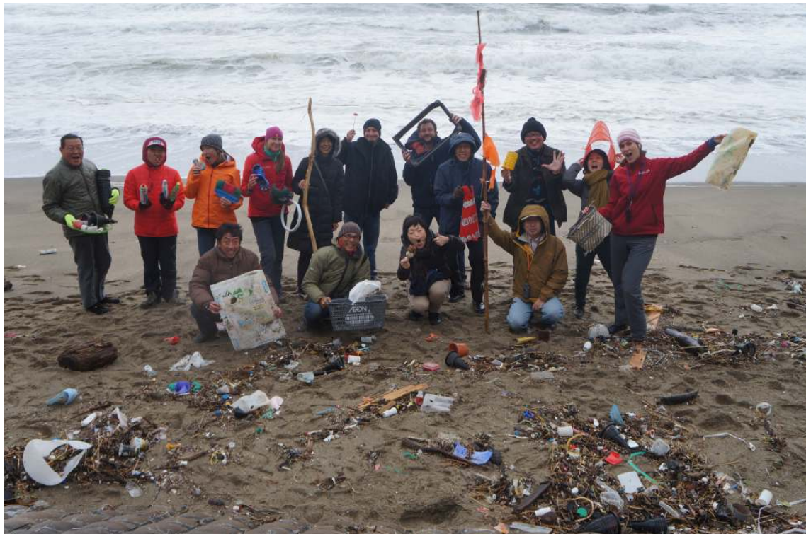
The ocean connects us all, even from halfway around the world

We travelled along the Sea of Japan (East Sea) and the Pacific coast attending workshops, public symposiums and visiting some of the hardest hit shorelines. Quickly, we became a close-knit group sharing our stories on how we are each working to clean up tsunami and marine debris from our respective shorelines.