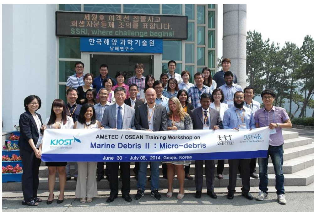
The participants of the marine debris training program

Jang, Yong Chang. (2014). Asian environmentalists trained in Korea. Marine Litter News from East Asia Civil Forum on Marine Litter , Vol. 5(2): 4-5.