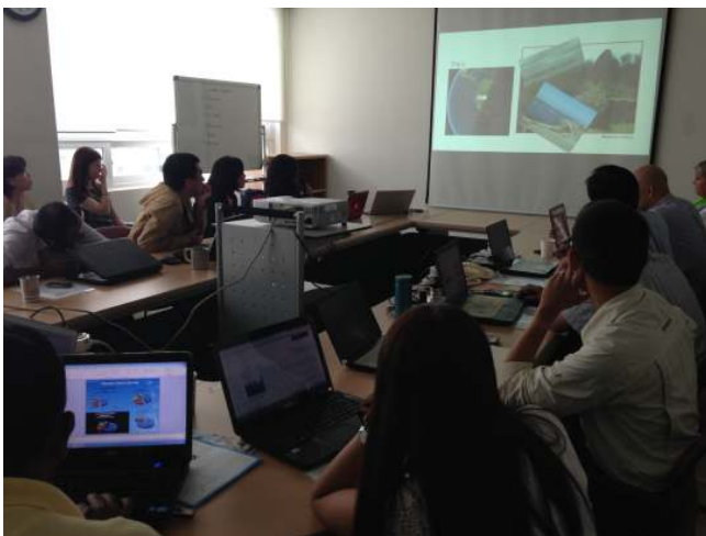
Country report from each participant