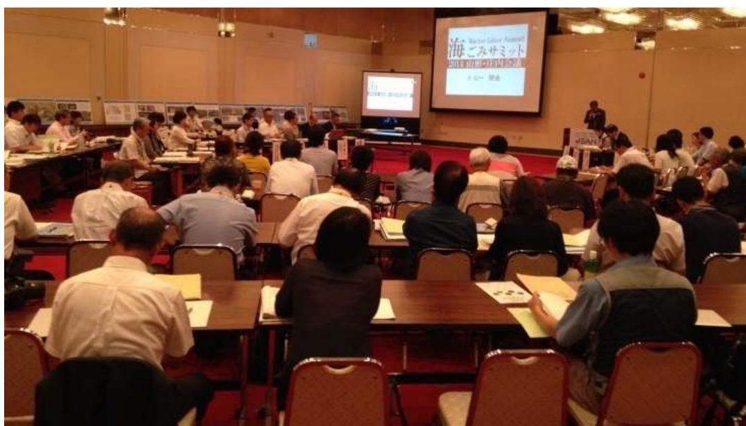
The 12th Marine Litter Summit held in Yamagata Prefecture, Japan (23-27 July)

Choi, Sophia. (2014) The 12th Marine Litter Summit at Yamagata Prefecture (23-27 July 2014). Marine Litter News from East Asia Civil Forum on Marine Litter , Vol. 5(2): 8-9.