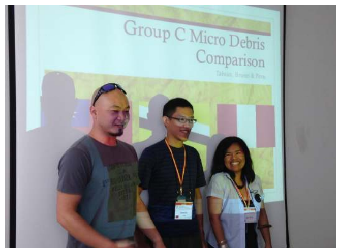
Group presentation on microplastic analysis