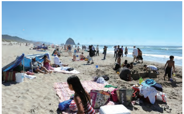
* A scene at Canon Beach—Local people were quite surprised with group including foreigners who were followed by many media crews with cameras and microphones.

Coincidentally, during our visit, there will be a community cleanup at Kamilo Point, a ragged beach on Hawaii Island, so we will arrange our schedule to join the cleanup. Kamilo is known as a beach that attracts much marine litter because of its geographical location. We are wondering if we will find any objects washed ashore from the tsunami after the earthquake; and if we do, what kinds of items will they be?