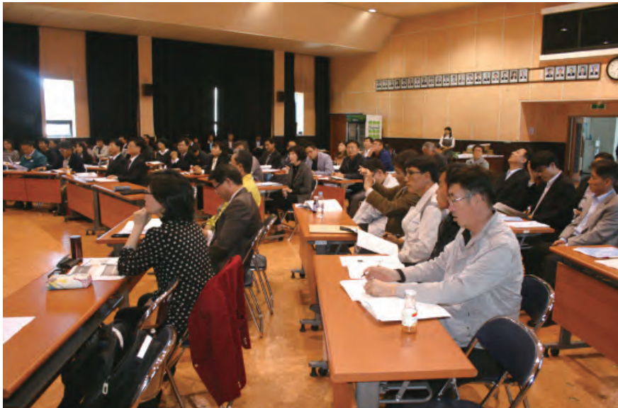
* About 90 stakeholders participated to the workshop in 2012

We are planning to make a full-length report on the result of the workshop. From the report, the best policy measures on EPS float will be developed. We will spread the report to the participants and to the policy decision makers so that they can use the information. We will continue our activities until the EPS float marine debris problem is solved clearly.