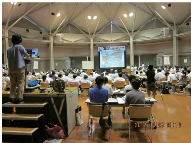
* Integral discussion program on Aug. 25, 2012