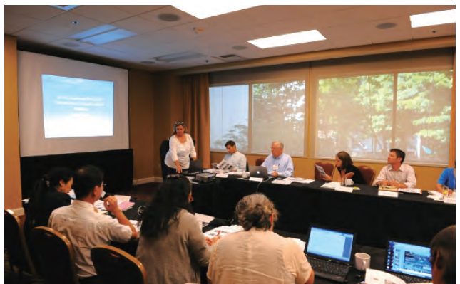
* The Hawaii State ICC coordinator’s presentation.