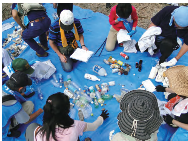
* 71 people participated for the ICC survey. We retrieved 68 30-liter bags of trash totaling 220kg, including many plastic beverage bottles (PET bottles).

After closing the summit, we also conducted wrap up lessons at four municipal elementary schools, which also participated in the preliminary event. It seemed to be a good opportunity to learn about the problem of marine litter afresh, through the trash entanglement simulation experience and by hands-on experience on a real and interesting driftage other than trash.