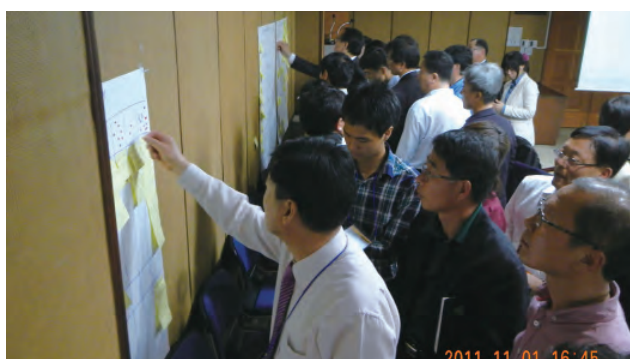
* At the workshop in 2011, the participants polled with marks for the best policy measures.

OSEAN began to find the stakeholders of the EPS float issues in 2009. The Korea Foam-Styrene Recycling Association ( http://www.eps.or.kr/ ) agreed with us that EPS debris is a serious problem. From 2010, the Association has been financially supporting OSEAN to hold the workshop on EPS debris and recycling every year.