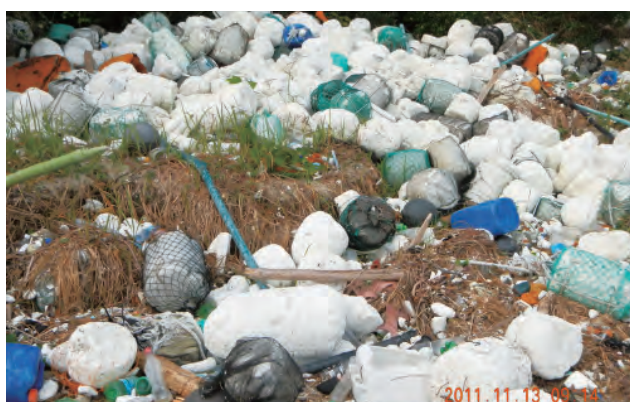
* The EPS float debris in a Korean island

OSEAN (Our Sea of East Asia Network), an NGO in Korea, has devoted itself to solving the Styrofoam debris problem from its establishment in 2009. Here is the procedure of three-year activities on solving the problem. The result of the workshop on EPS float held on October 25, 2012 in Geoje Island in Korea is summarized.