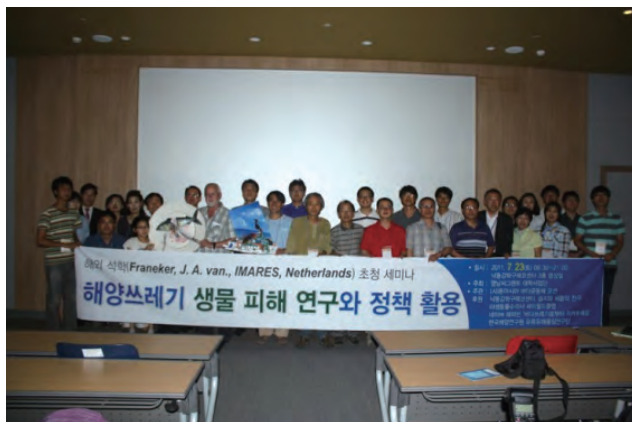
* The seminar was held in Busan in 2011 with the financial support from Young Nam Sea Grant.

We have summarized the cases in various viewpoints, and analyzed them. For example, leisure fishing explained more than 70% of the cases, which means we need to make effort to reduce marine debris from leisure fishing. As we thought we need to share the research process and result with more people, we published a book and a scientific journal paper. The pdf file of the book can be downloaded from our website. The scientific journal paper (hong et al., 2012) can be purchased from the journal website.