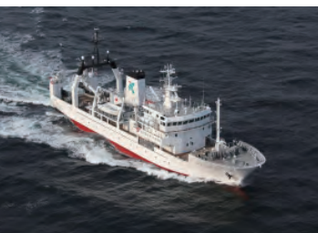
* Kagoshima University training vessel “Kagoshima-Maru”

is difficult to separate these floating marine debris between Tsunami debris and general marine debris, because both are mainly the same plastic and general items. We are worried that the increasing plastic in the ocean would increase the number of accident by plastic. Of course, this tuna was deliciously eaten by us.