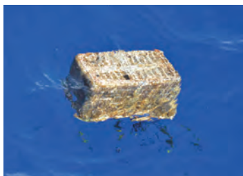
* Drifting marine debris with gathering fishes