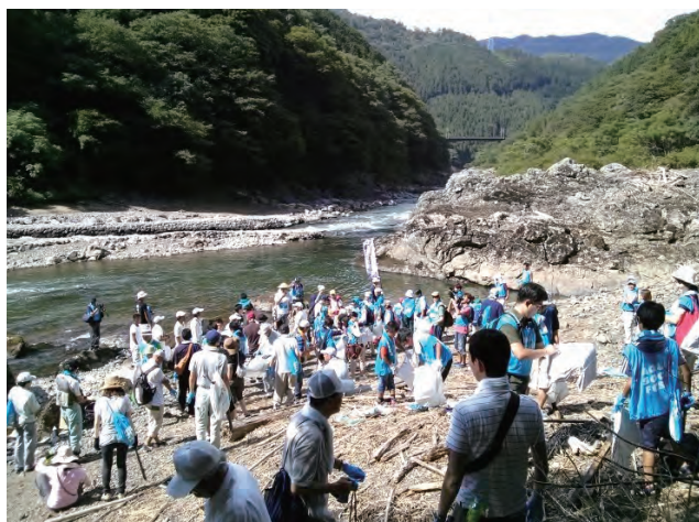
* A scene at Canon Beach--Local people were quite surprised with group including foreigners who were followed by many media crews with cameras and microphones.